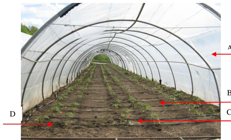
Fig. 1. The establishment of the experiment

The experimental protection tape was established with the same, unfertilized hybrid.