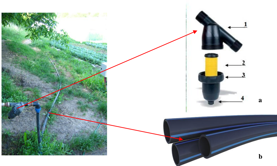
Fig. 3. a – filter: 1, 3 – filter case; 2 – disc type filter; 4 – outlet valve b – main water distribution pipeline

The secondary water distribution pipe (Figure 4) was placed perpendicularly to the plant rows and was meant to feed the watering tapes representing the active part of the drip irrigation system.