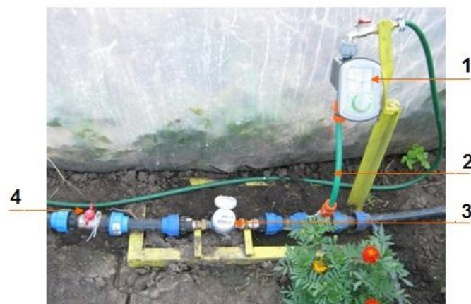
Fig. 4. Automatic watering schedule

1 – irrigation programmer; 2 – fertilizing solution hose; 3 – apometer; 4 – way valve.