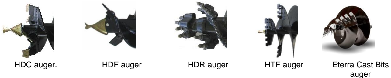
Fig.5. Dedicated augers used by drilling equipment's for degraded soil. [7, 8]

versatile augers with short coils, who works sequentially on reduced depths. From this category is presented the Eterra Cast Bits auger, which is provided by the supplier with an extension shaft such that it can be adapted higher ground clearance to equipments and to increase the working field.