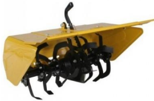
Fig. 3. 66 cm earth miller designed for PRO TRAC motocultivator [93, 94]

The number of blades and their placement of the miller rotor is very important because depends the crust splitting level and the earth crushing. In forestry area it can be successfully used the earth misaligned millers, Fig. 3, made by APESA Company.