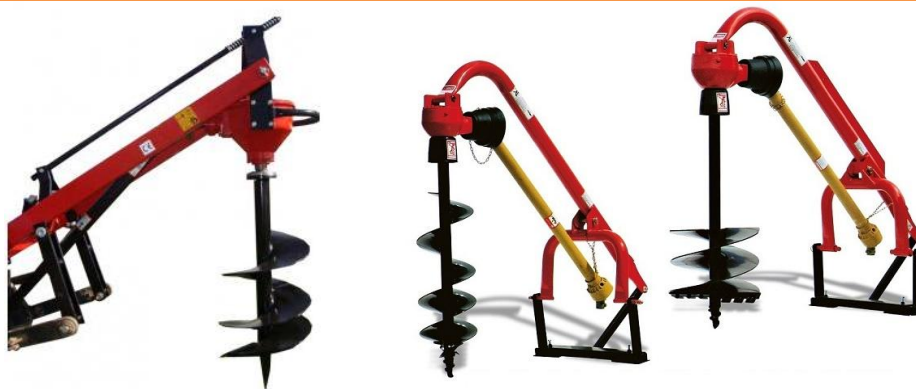
Fig. 4. AGROSEZ and EUROMARKETING drilling equipment's [5, 6]

The vertical drillers can also work in aggregate with tractor can especially when the drilling holes are positioned on bough sides of the central tractor axis, especially for slope terrenes. The devices which are equipped the standard models are: oil bath gearbox; shaft with protection; 3-point adjustable mounting system to adapt to the tractor; vertical control system to maintain squareness; screw to control the lateral movement; cross slope compensation system. The drilling equipment, presented in fig. 4, works at maximum depth of 1000 mm and the auger diameter is between 250...600 mm, this equipment works in aggregate with tractor and has 3-point connecting system and also can be successfully used in agriculture to establish forest belts and fruit-growers (fruit-trees plantation).